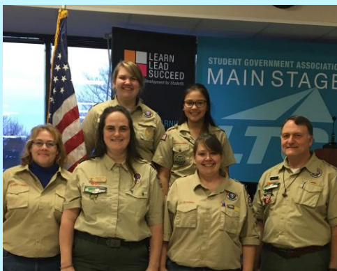
Troop 6001 had a blast at the University of Scouting!