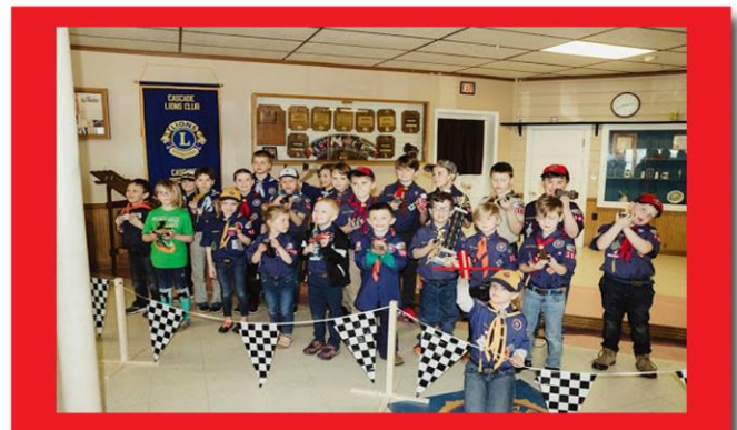
Cub Scout Pack 3880 Pinewood Derby 2020

PS: you should have seen the look on Pete's face when the winner of the trophy (Bill B.) thought it was too cool to be a one-off and offered to make it a traveling trophy. Pete's first words? Uh... we're doing this again next year? Of Course We Are!!